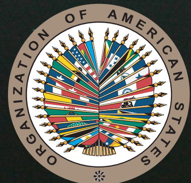
Organization of American States